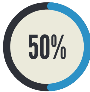
Rigid Contact Lenses (5% of market)