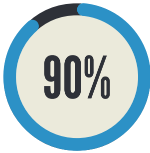
Soft Contact Lenses (95% of market)